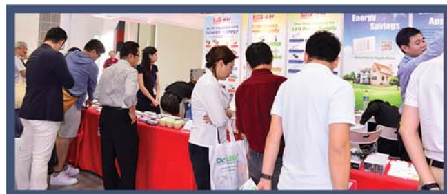
Exhibit and be a sponsor today!

Contact ssa_sponsorship@cems.com.sg now!